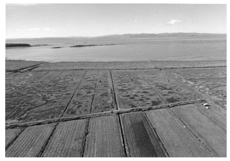
FIGURE 7.3 Reconstruction of the Aboiteau of 1941, Bay of Kamouraska, 1980

In so writing, Gourde recognised that the flora of the inferior and intermediate marshes was vital to the fauna of the marshlands - especially waterfowl. Nevertheless, he argued that the aboiteaux would have little impact on wildlife because of their location on the upper marsh, which, he believed, was not a vital habitat. Waterfowl like geese were capable of adapting to changing environments, he continued, as seen by their frequent feeding in the grain fields of the region. He further stated that the 27.6 km