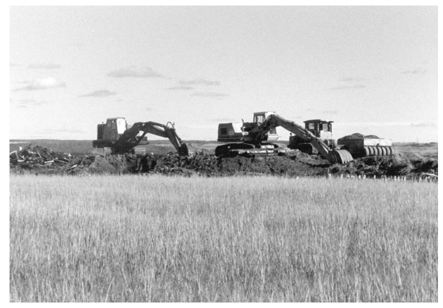
FIGURE 7.1 Aboiteau Reconstruction, Bay of Kamouraska, 1980